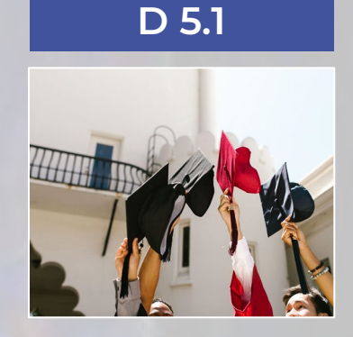
Transnational Training Course on Risk management of cultural heritage