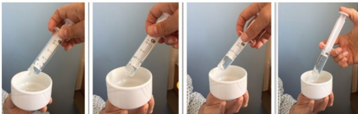
Fig. 9 Water test in increasing volume (3, 5, 10, 20ml)