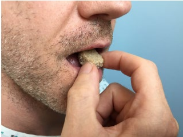
Fig. 12 Swallowing test with bread (1.5x1.5) "SOLIDS" subtest