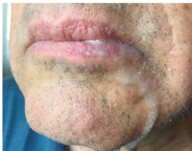
Fig. 2 Saliva drooling