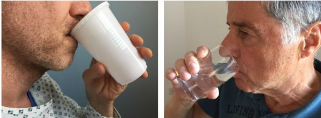
Fig. 10 Drinking 50ml from a cup or glass