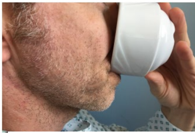
Fig. 8: Drinking 3ml of water from the cup