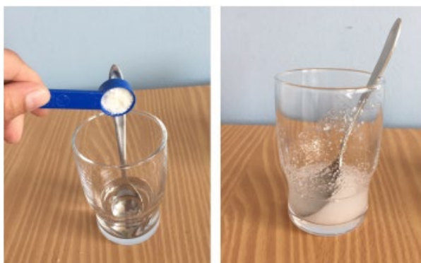
Abb. 5. Thickening water for the semisolid swallow test