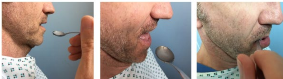
Fig. 6 Application of half a teaspoon of thickened water