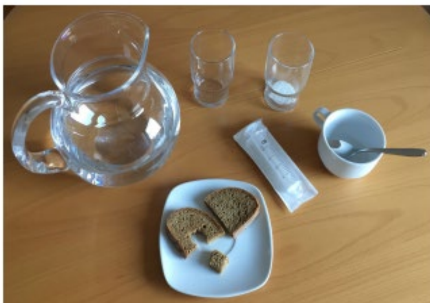
Fig. 1 Utensils for the GUSS-ICU